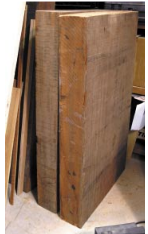
4" X 20" END PLANKS CUT TO LENGTH