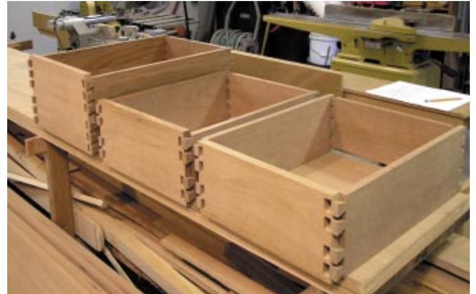
DRAWERS, DOVETAILED, READY TO GLUE

360-357-2850 WWW.DONFREAS.COM DON@DONFREAS.COM