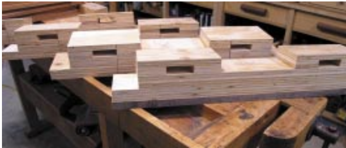
IN-WALL SHELF MORTISE BRACKETS