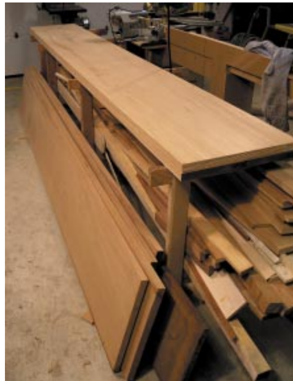
TOP AND SHELF PLANKS (6) 18" WIDE, 10' LONG