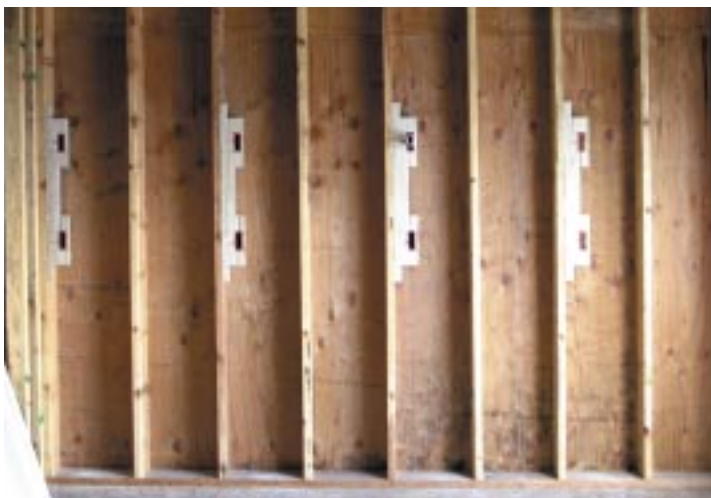
INSTALLED MORTISE BRACKETS